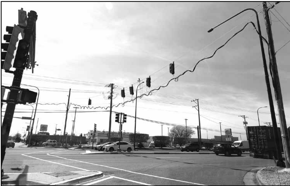
Work is being done to modernize traffic lights and construct new ADA compliant sidewalk ramps at 79th & Harlem.