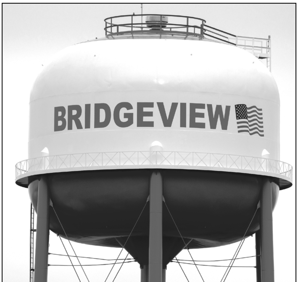
The Village of Bridgeview receives its water from the City of Chicago.

This year the increase will be slightly over 3%, and the new rate will be reflected on the May billing.