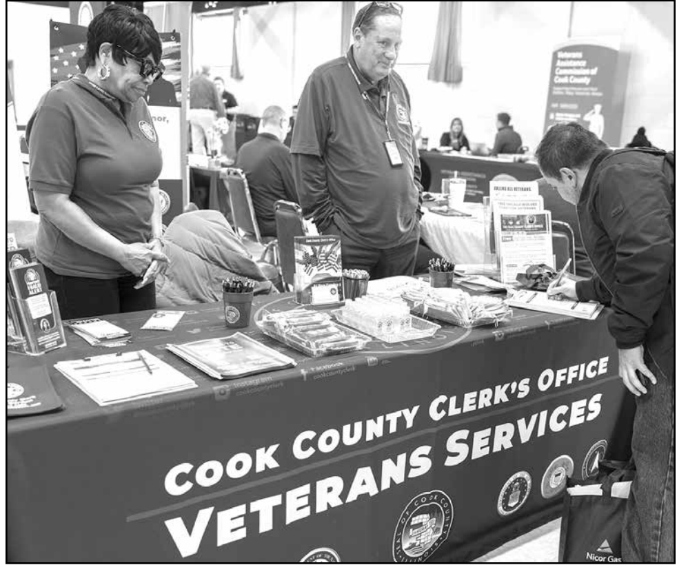
The Cook County Clerk's Office speaks with a Veteran.

glass is accepted. Put out only residentially generated items. No business electronic waste is allowed. Delete personal information from hard drives. Please call the Village Hall front desk at 708-594-2525 for more information.