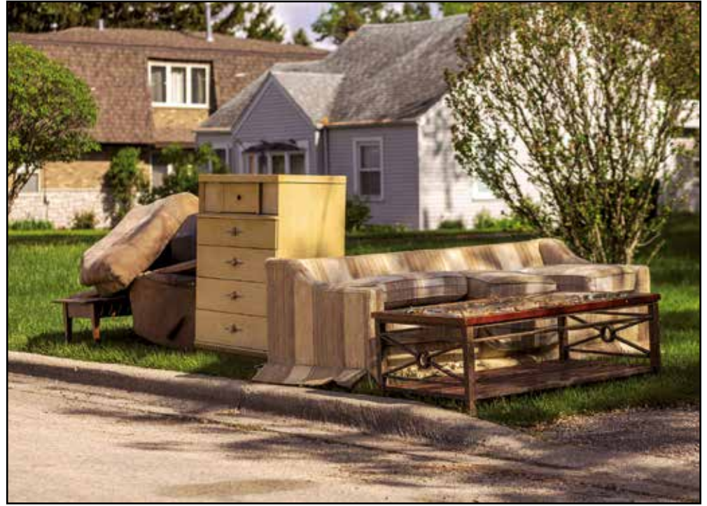
Get rid of unused furniture and other bulk items.

Oil or gasoline must be drained from lawnmowers, trimmers, or other types of machines. Refrigerators & freezers must be drained. Paint cans must be dried using sand or kitty litter before disposal. All non-bulk items must be