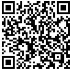
Pet Tag Application

Village of Bridgeview 2025-2026 Vehicle Stickers & Pet Tags are ON SALE NOW at the Village Hall Customer Service Office. This year's vehicle sticker honors the Bridgeview Lions Club, one of the oldest civic organizations in the area that has volunteered to help clean up the Shooting Star Prairie, has provided free vision screenings at the Community Center, and actively engages with the community by honoring community members at the annual Super Sunday event. New vehicle stickers must be displayed on your vehicle beginning June 1st. Applications are available in person at the Village Hall Customer Service Office. You can also download and print the applications by scanning the QR codes. 2024-2025 Vehicle Stickers and Pet Tags EXPIRE May 31st.