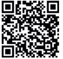
2024 Day 1 Recap

The fantastic Lyrical Lemonade Summer Smash is returning to SeatGeek Stadium in 2025 for the weekend of June 20th-22nd. Now in its seventh iteration, the premier Midwest hip hop festival is once again bringing together iconic artists, including Don Toliver & Yeat, Future, Young Thug, and Chance the Rapper! Last year, the festival had a record-breaking 100,000 people in attendance across the three days. To see the photos and recaps of each day of last year's amazing Summer Smash, scan the QR Code and visit the Village of Bridgeview website.