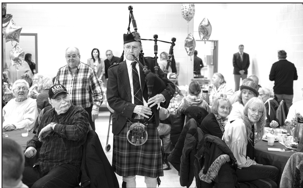
The skilled bagpiper wowed the crowd.