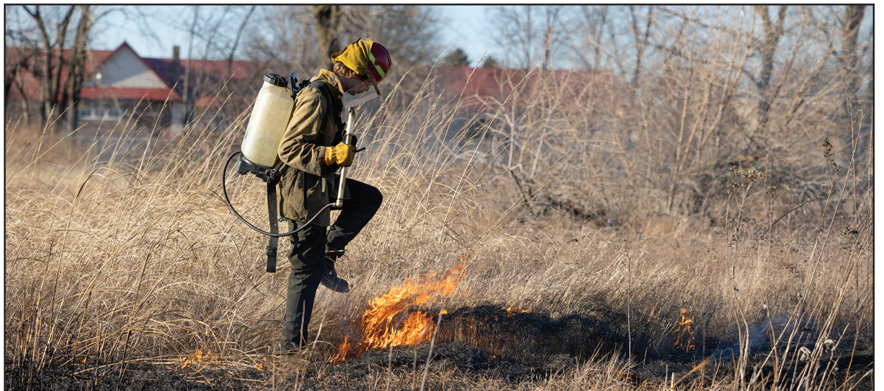
A Pizzo employee stamps out flames at the Shooting Star Prairie.