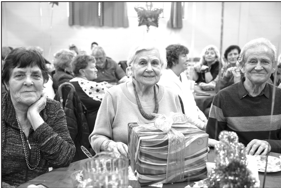
Lucky residents enjoyed raffle prizes!

Charles & Company returned to the stage to keep people dancing, singing, and laughing throughout the afternoon, breaking only for the exciting raffle prize giveaways where anyone could be a winner with a little luck. The Village of Bridgeview appreciates all who attended for helping the Lucky Luncheon strike gold.