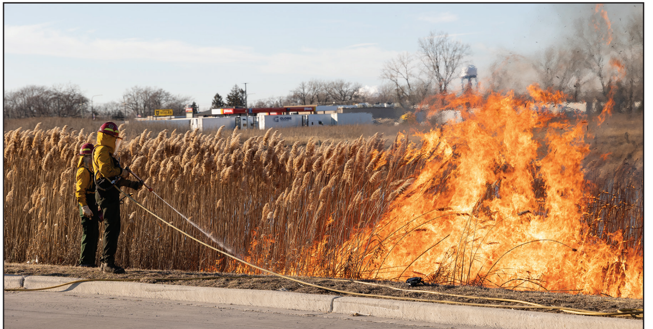
Pizzo employees work together to ignite plants and control the burn around the retention pond adjoining the prairie.

less desirable plant species cannot tolerate fire while the native, more desirable prairie wetland plant species benefit from the burn. Burning taller plants and groups of non-native plants reduces competition and frees up space for new native plants to grow. The ash from the burn also adds fertility to the soil for the spring seeds to bolster their growth. The controlled burn replicates naturally occurring burns, safely stewarding the prairie and ensuring it remains an oasis for native flora and fauna.