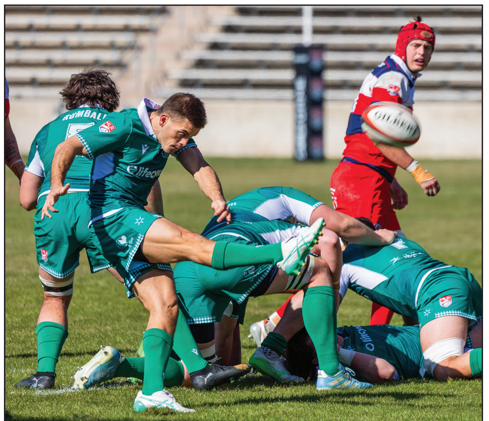
The Hounds kick the ball back, relieving pressure from the Free Jacks.