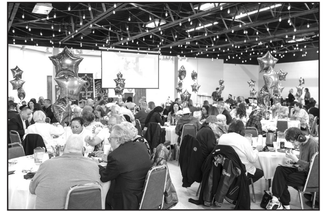
Community members dine as a slideshow of Lions Club activities plays on screen.