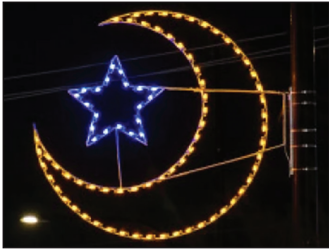
One of the Ramadan displays lights up the night.