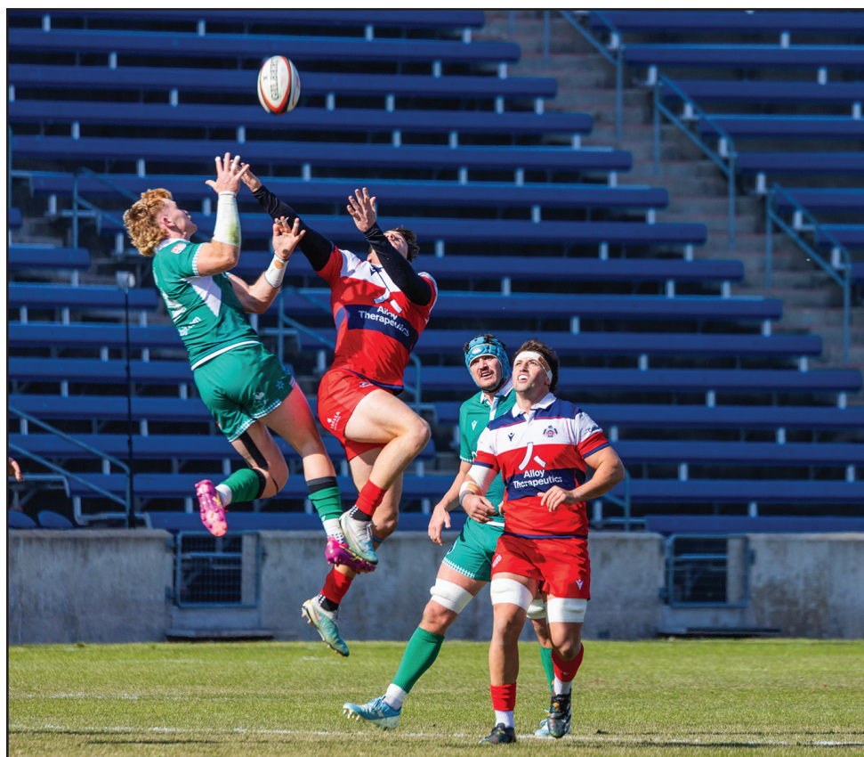
A Hound and a Free Jack leap into the air to grab the ball.