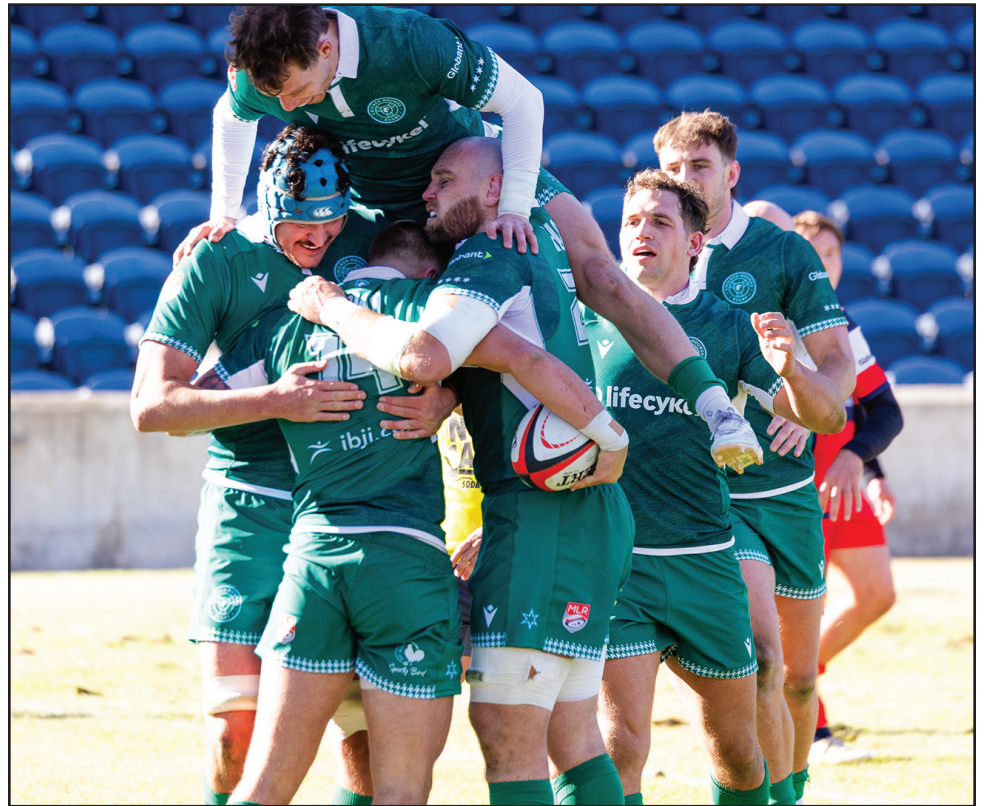
The Chicago Hounds celebrate after another successful try!

This is only the beginning of the 2025 Major League Rugby season, and the Hounds have already established themselves as a powerful force with both offensive and defensive pressure. While they did lose to the Utah Warrior at their Home Opener, the Hounds' wins over the Houston SaberCats, the New England Free Jacks, and the Miami Sharks place them firmly in 3rd place in the league with their strong 3-1 record.