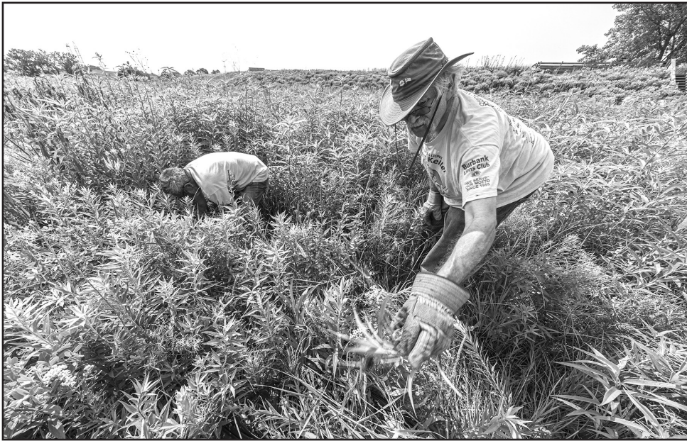
Bridgeview Lions remove invasive plants at the Shooting Star Prairie.