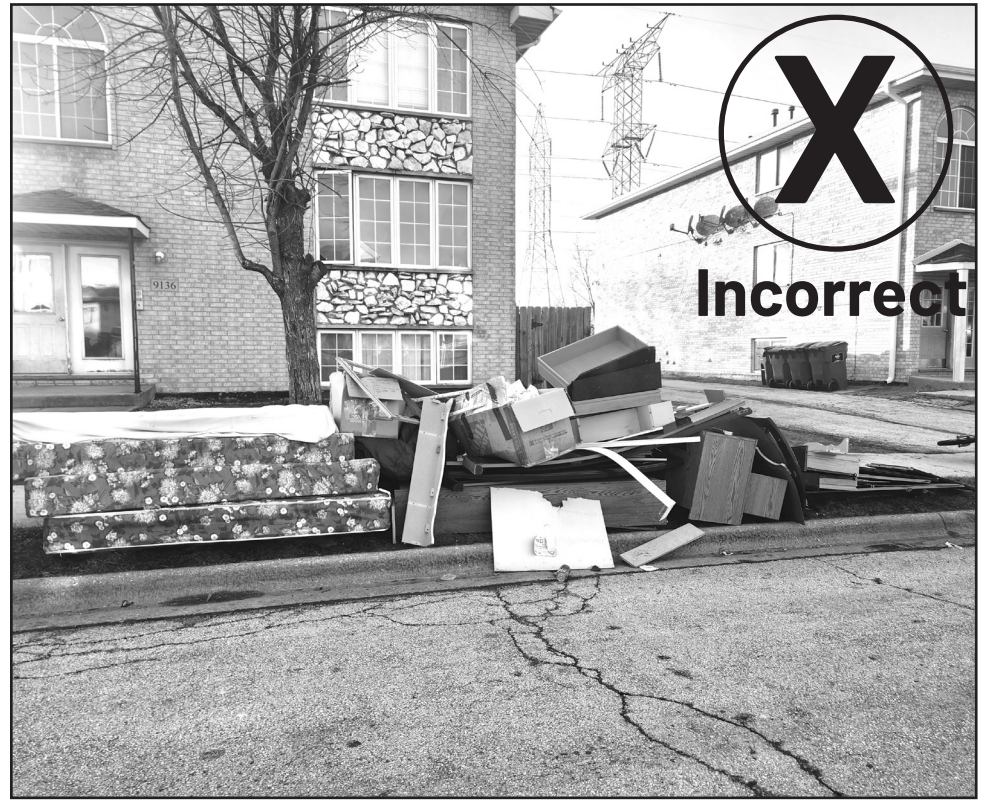
Piles of trash strewn on a lawn will not be picked up on garbage day. One bulk item placed on the curb is allowed.