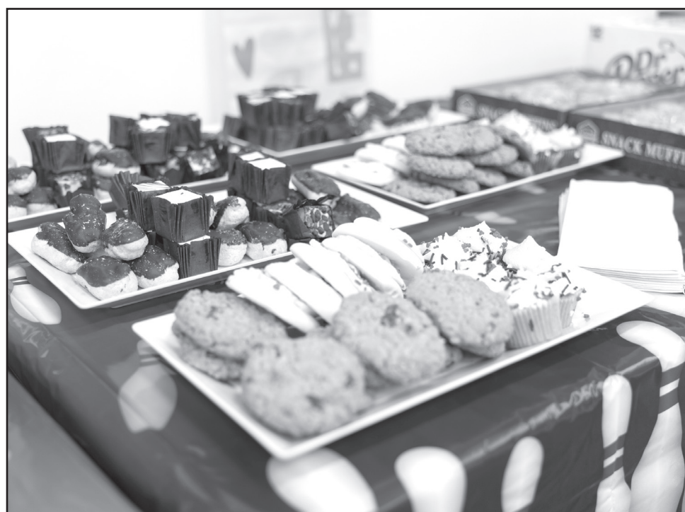
Delicious desserts made the friendly event even sweeter.

Nearly 40 seniors came together from Bridgeview, Stickney Township, and Palos Park to compete for their respective Wii bowling teams at the 2025 Cross Harlem Classic. The Bridgeview Park District and Louis Viverito Senior Center (Burbank, Stickney Township) teams have a kind rivalry after years of hosting each other annually for the relaxed Cross Harlem Classic since 2013, and they decided to increase the size of their event by inviting new competitors, Peace Village (Palos Park), to the biggest senior Wii bowling tournament they've ever put on.