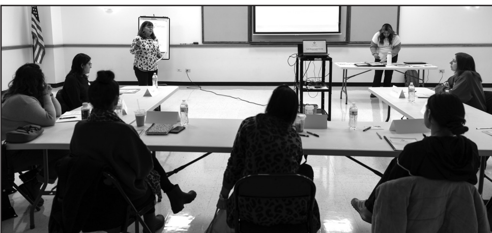
Participants learn and discuss how to support youth mental health.

from Bridgeview, Burbank, Summit, Justice, Elmwood Park, and Elgin, dove into the steps of the non-linear ALGEE action plan (Assess, Listen Non-Judgmentally, Give Resources, Encourage Professional Support, Encourage Self-Care) for addressing youth mental health crises and problems, learned the signs and symptoms of mental health problems youth might experience, learned how to respond to a person experiencing a drug overdose, and practiced life-saving skills. The instructors came from the Mental Health Commission of Lyons Township and Pillars Community Health and answered questions from the participants to ensure they felt confident in providing Youth Mental Health First Aid as certified YMHF First Aiders by the end of the class.