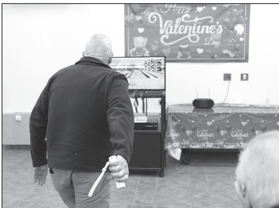
A player winds up for the swing as he attempts to pick up a spare.