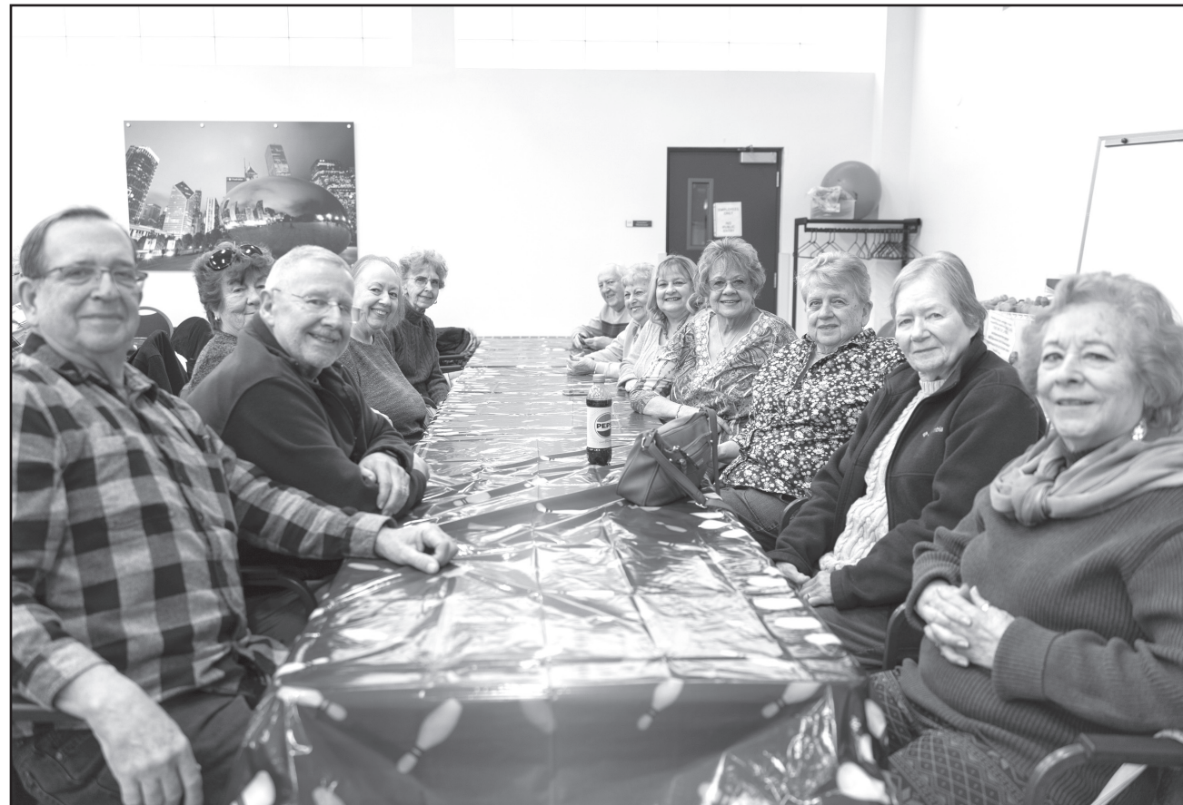
The Bridgeview Park District team smiles before the competition.

After a couple of hours of eating, laughing, and virtual bowling, players received gift bags and congratulated each other on an afternoon of fun filled with strikes, spares, and occasional gutter balls. The Bridgeview Park District will host the competition next year, keeping the spirit and comradery of the Cross Harlem Classic alive.