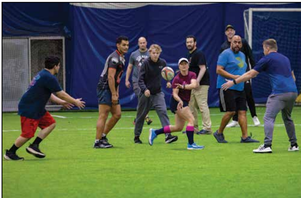
Adults play a safe walking rugby match.