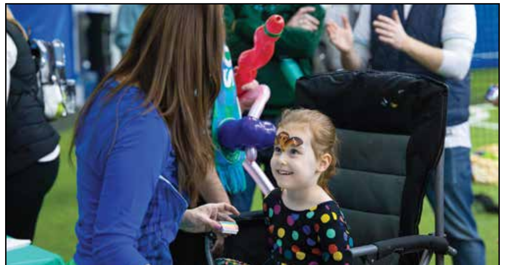
A new rugby fan gets a gingerbread face-painting.