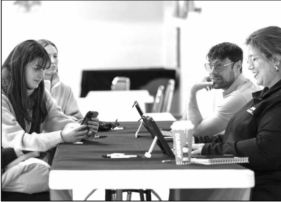
IDFPR employees assist residents with their licensing issues.