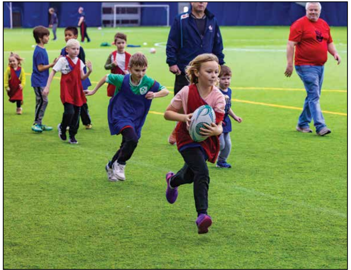
Children learn the game of rugby!

Those who weren't trying out the game enjoyed crafting Christmas tree ornaments, having their faces painted, requesting unique creations from the balloon artist, tossing bean bags, and spending time at the holiday photo area with Rugby Claus and Houndy, the team's lovable mascot. After a full afternoon of activity, everyone chowed down on carb-filled pizza and treats while listening to the DJ's holiday tracks. The engaging rugby fest provided fun for the whole family and showcased the exciting game played by our very own Chicago Hounds who are planning youth clinics, school partnerships, and more community gatherings in the future to make rugby accessible and inviting to everyone!