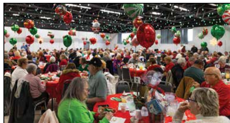
Seniors filled the Community Center with holiday cheer!

With it being 'the most wonderful time of the year,' on December 11th the Bridgeview Community Center was home to the cozy and festive Happy Holidays Senior Luncheon hosted by the Village of Bridgeview. Residents 55+ were immediately greeted by hundreds of holiday balloons, beautifully wrapped presents, and Christmas-themed lights that set the tone for wonderful festivities.