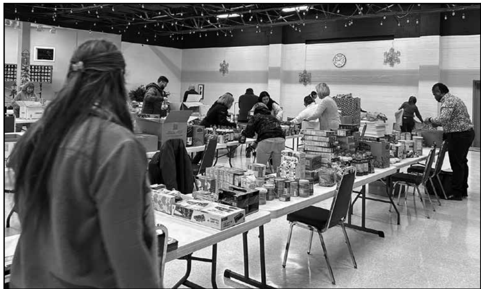
Volunteers pack toys and nonperishable foods for distribution.

On Wednesday, December 5th the Bridgeview Chamber of Commerce collected and distributed items donated for their Food and Toy Drive. Along with Bridgeview's Village Hall, dozens of local businesses and organizations served as drop off locations for canned goods, dolls, toy cars, and more to make life a little better for those in need in our area.