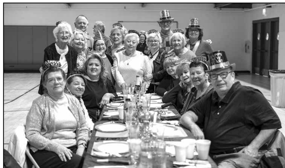
Residents celebrated the Noon Year in style!