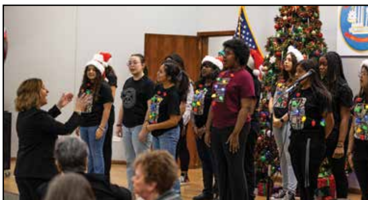
The Argo High School Choir sings Christmas classics!