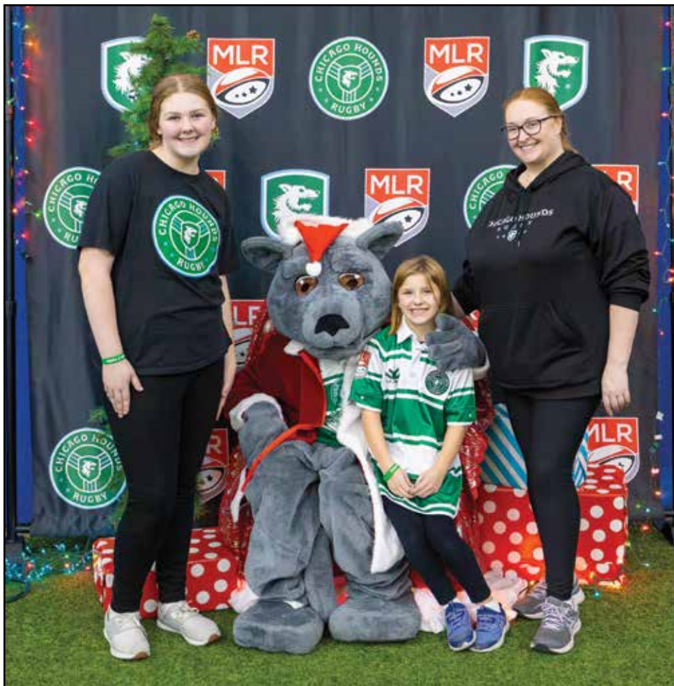
Fans take a photo with Holiday Houndy!