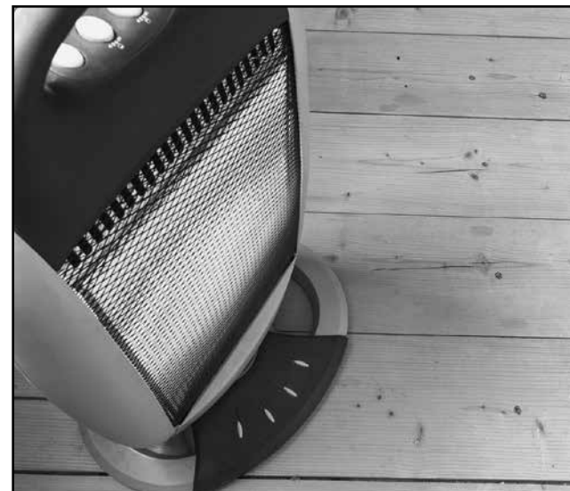
Unplug space heaters when not in use and avoid plugging in multiple devices to one outlet to avoid electrical fires.

own heat when you engage in physical activities.