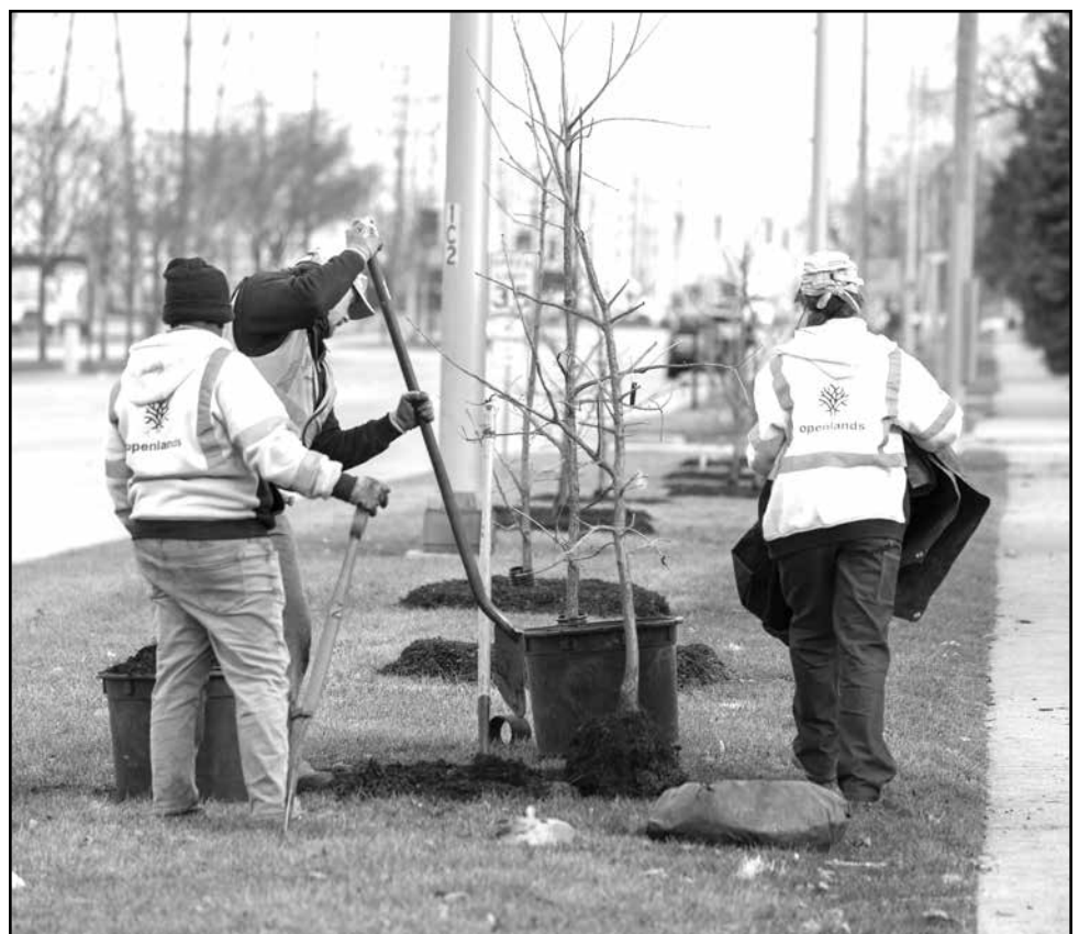
Openlands plants a line of trees along 71st St.

tifying our community and supporting the environment. The new trees may not look like much in the winter, but along with the native pollinator gardens planted around Village Hall's sign and the entrance to SeatGeek Stadium, the spring will show just how green the Village of Bridgeview is.