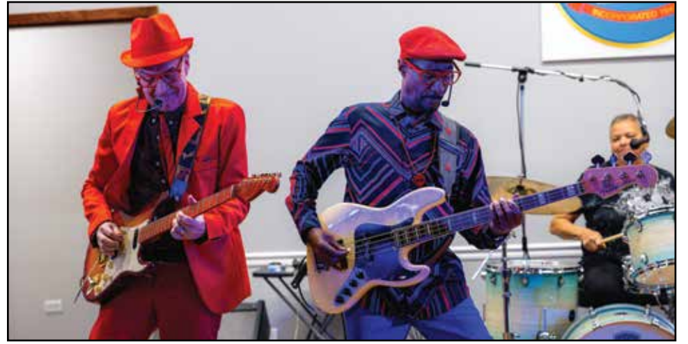
Charles & Company rock the house!

Bridgeview residents 55+ gathered in the Bridgeview Community Center on Wednesday, February 21st at 11:30am for the lovely Sweetheart Luncheon hosted by the Village of Bridgeview. Delicious food and a Village board meeting kicked off the event, with the incredible Charles & Company captivating the excited audience with their live musical performance soon after.