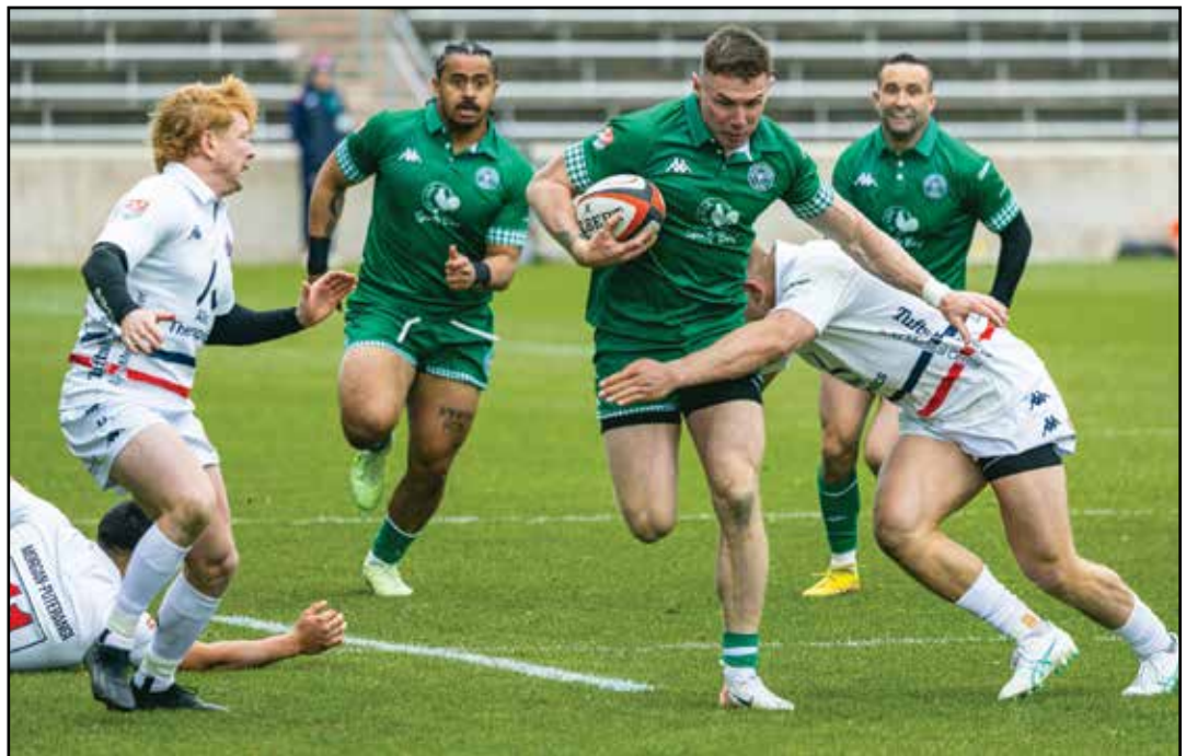
The Chicago Hounds barrel down the field fending off the 2023 MLR Champions!

To request tickets, Bridgeview residents can scan the QR Code on this page to sign up online, call the Village of Bridgeview Customer Service Office at 708-594-2525 (ext. 3), or send an email to info@villageofbridgeview.com . Tickets will be emailed on a first come, first served basis and will be delivered digitally to your email prior to the event.