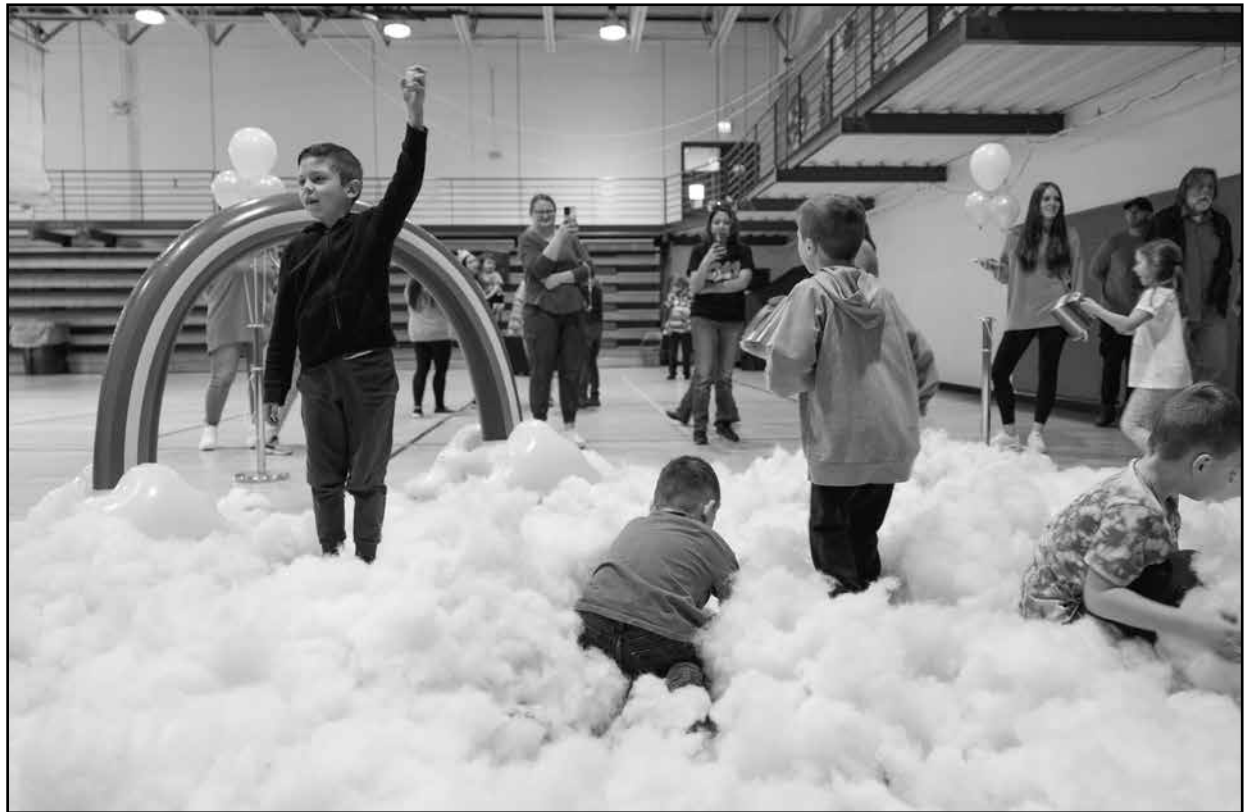
Children search for ducks in a sea of cotton clouds.

It wasn't long before one lucky searcher found a special golden egg that earned them a great prize—a truly gigantic peep! There were three golden eggs in total, and the Easter Bunny appeared to drop hints about the remaining golden eggs' locations. At least one hundred people showed up for the event, and children went home with smiles on their faces after an egg-citing night of scavenging!