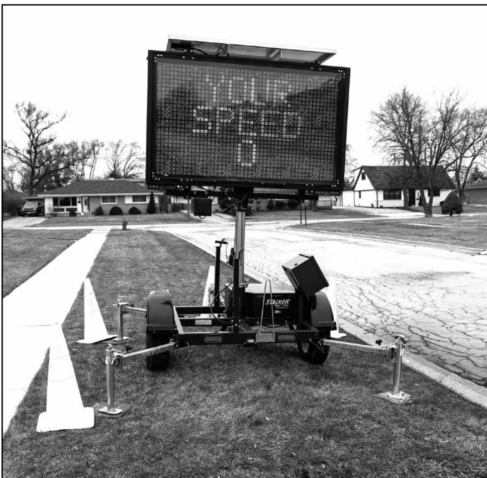
The speed sign monitors traffic on a residential street.

ing notice to speeding cars that may not even realize how fast they are moving and helps reduce speed violations. Bikers cycle around, children walk to school, families walk their dogs, and people drive throughout our Village, meaning there are plenty of people to protect by following our traffic laws. Let's all be mindful of our driving speeds to keep our fellow community members safe.