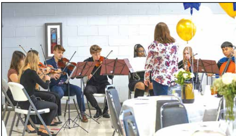
The Argo Community High School Orchestra plays music for those honored by the Lions Clubs.