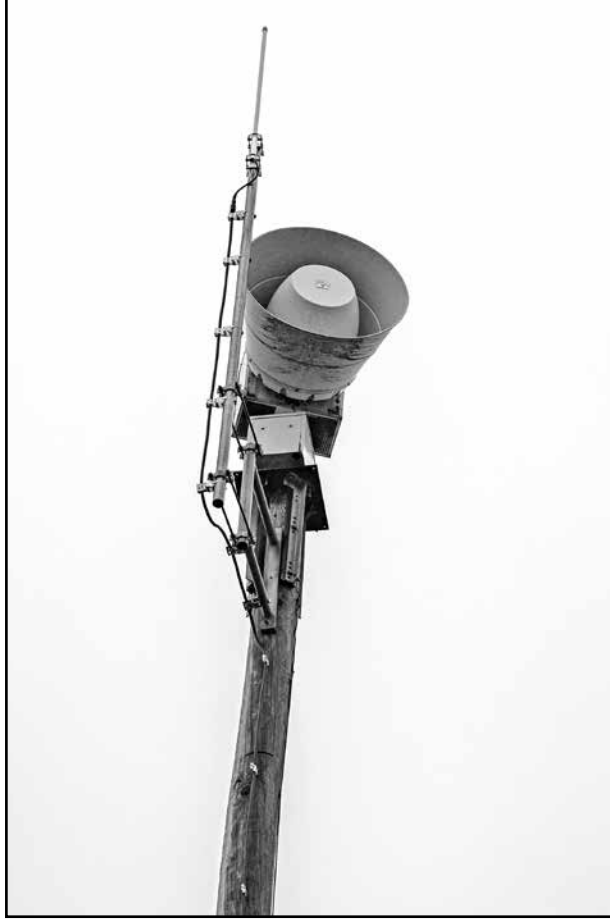
The Muehe Park emergency siren stands ready for use.

Bridgeview has three emergency sirens which comprise the Village's Emergency Outdoor Warning Siren System which are located at the Emergency Management Agency building, Village Hall, and Muehe Park. Recently, automatic monitoring and local activation features have been added to our system. These sirens as well as those of neighboring communities are typically turned on by Oak Lawn 911 operations when severe weather is reported. In the event that the sirens are not activated by 911 operations, the Village of Bridgeview now has the ability to activate the sirens on its own. This additional safeguard serves as a valuable backup and will ensure that the sirens are tested and activated as needed for the safety of the Village.