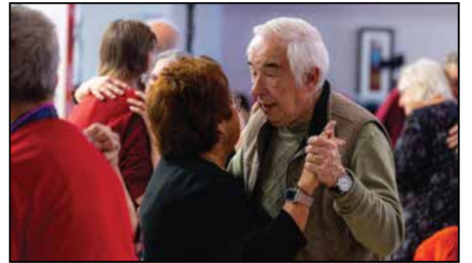
Couples enjoy a sweet slow dance after a string of fast-paced music hits.