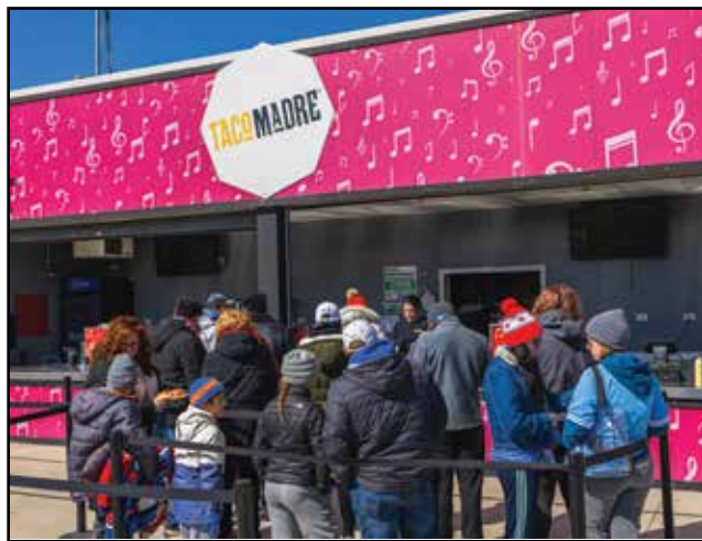
Taco Madre attracts a crowd within minutes of opening gates.

sine mixed with world-class flavors, Taco Madre is your go-to taqueria that offers authentic Mexican street tacos, traditional eats, and delicious Madre Style tacos. They're serving up mouthwatering meals at every Chicago Red Stars and Chicago Hounds home game this season! Using the freshest