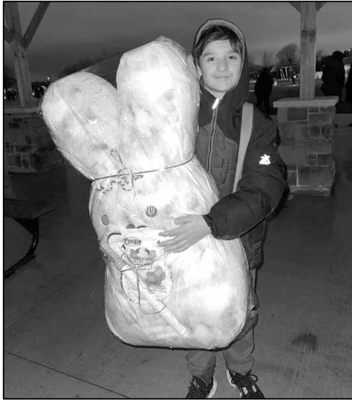
Lucky Golden Egg Hunter takes home a massive prize.