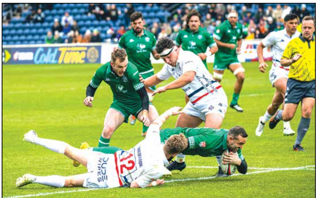
Chicago Hounds go all in for every foot they take on the field.