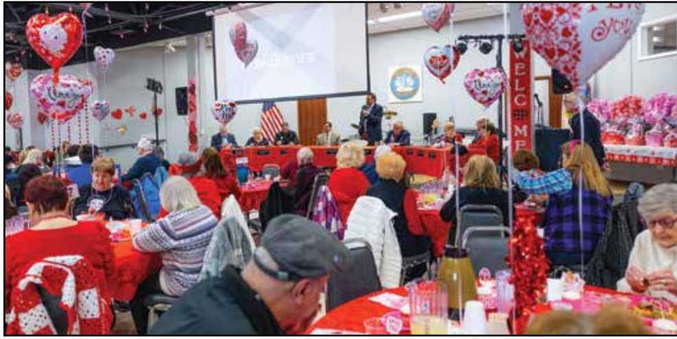
The noon meeting of the Village Board was held during lunch at the 55+ event.