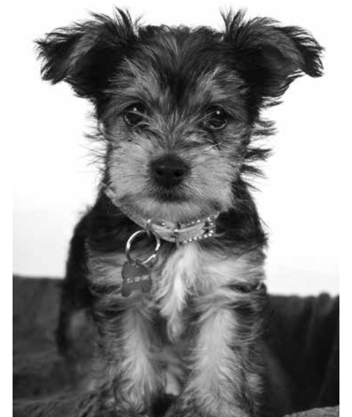
Tags are only $2 per pet!