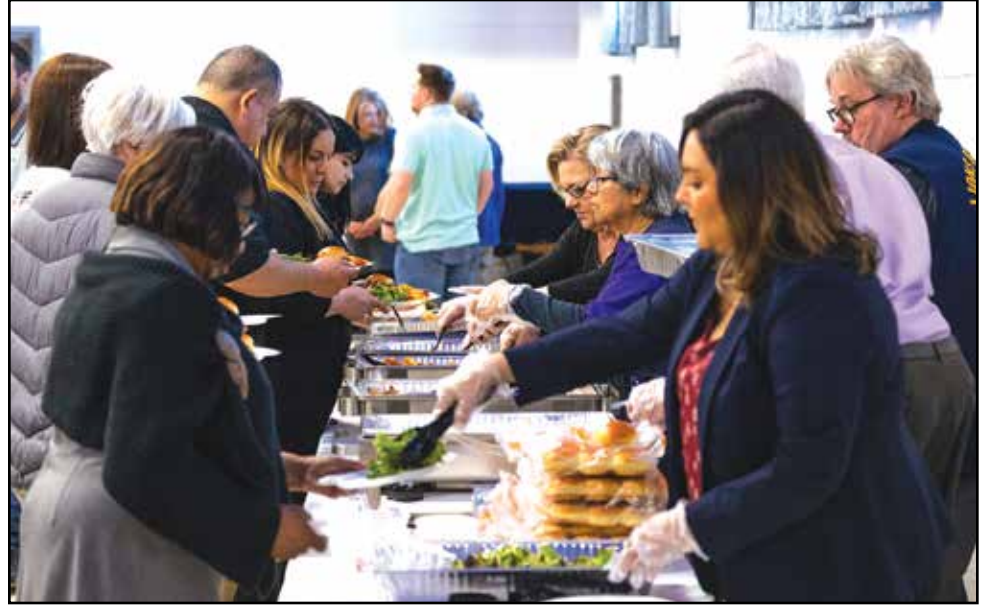
Bridgeview Lions Club members serve food to the Super Sunday crowd.