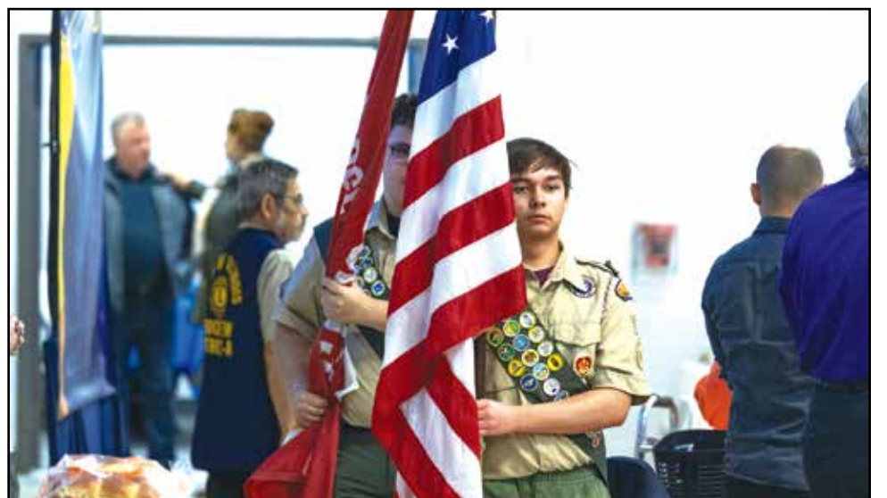
Bridgeview Boy Scout Troop 13 proceeds to post the colors for the Pledge of Allegiance.