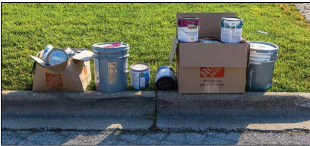
Old paint must be mixed into sand or kitty litter before being placed empty on the curb.

Ten Bridgeview residents lucky enough to have their raffle ticket numbers called walked away with elegant sweetheart-themed door decorations and gift baskets with chocolates, stuffed animals, and more. With the final prize awarded, Charles & Company took the stage once again to finish off the afternoon in style with both lively tunes and slow dancing. The Village of Bridgeview appreciates its employees, Charles & Company, and all who attended for making the Sweetheart luncheon so wonderful!