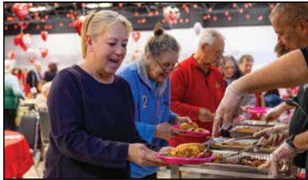
Bridgeview seniors are overjoyed with the month's delicious offerings from Niko's Banquets.