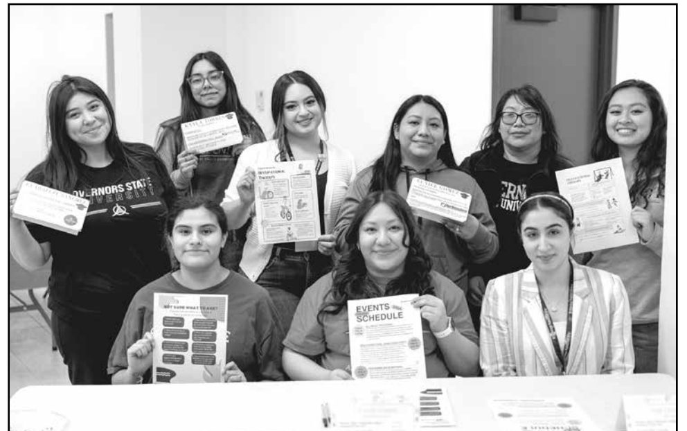
Photo of college student volunteers who answered common questions for teens about college.

Also on Thursday evening was the Bridgeview Public Library's All About the Degree event hosted by the Youth Services Department of the library to educate teens about college. Volunteers sat at tables and answered questions about why they chose to attend college, what helped them find their passion for their field, what scholarships they applied for, and anything else teens wanted to know