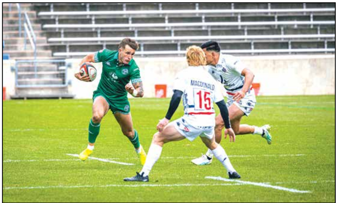
There is no safe place on the Rugby field, but the Hounds know every step counts!