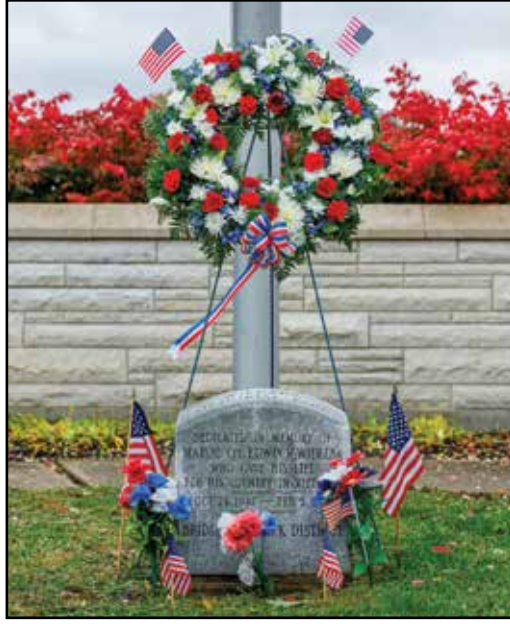
Weirzba Park 78th & Oketo