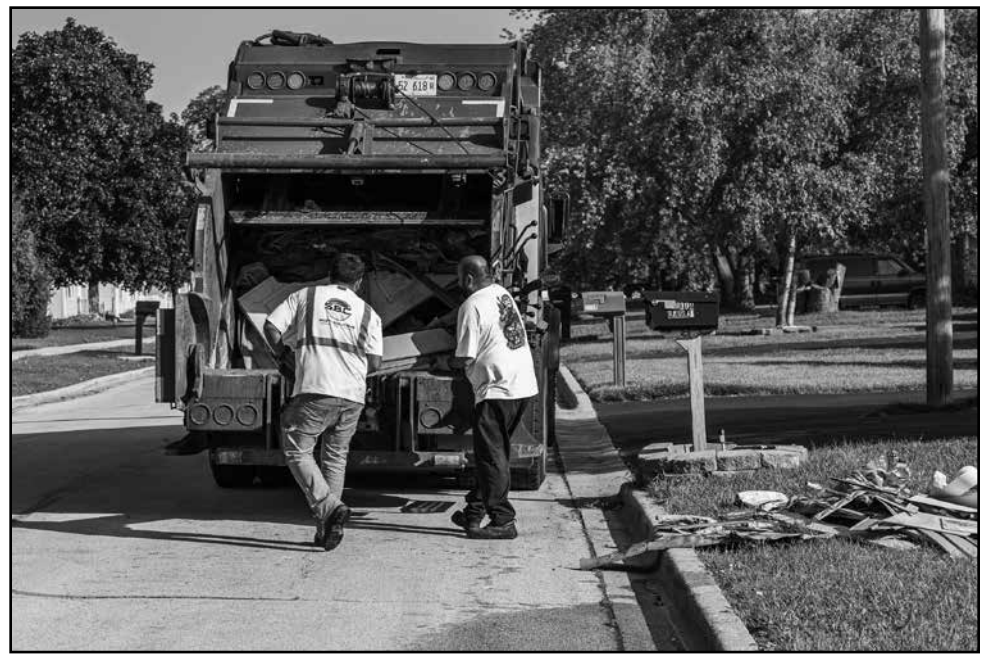
SBC Waste Solution employees remove large amounts of trash from the curb.