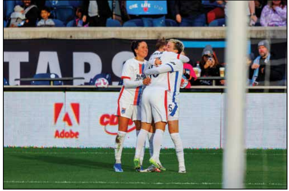
From left to right, Lauren Barnes and goal-scorers Jess Fishlock & Megan Rapinoe hug after Fishlock's goal.