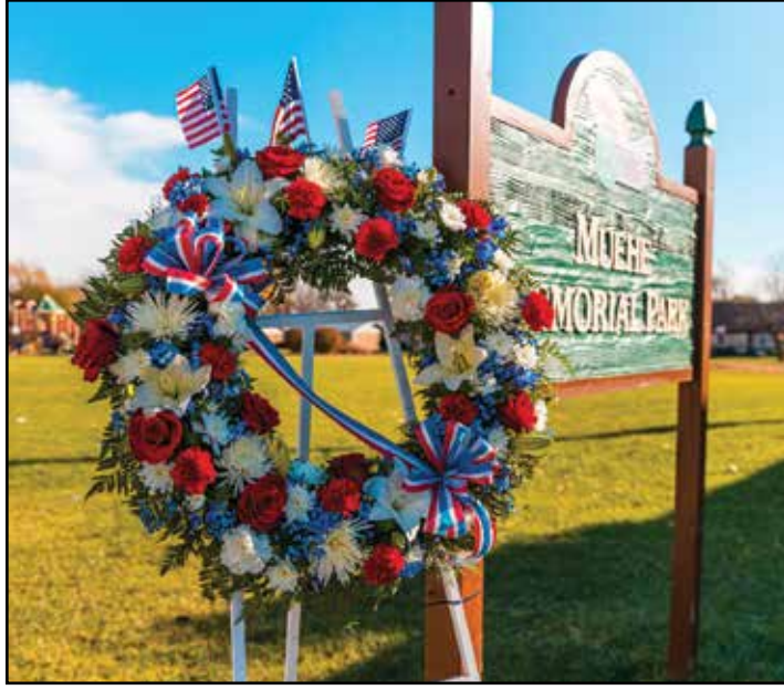
Muehe Park 84th & Harlem