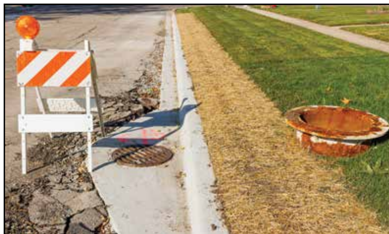
Old storm drain (right) to be discarded alongside its replacement (left).