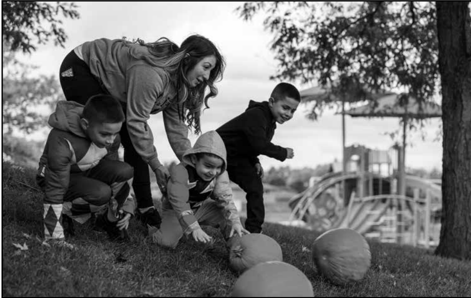
Bridgeview family enthusiastically rolls pumpkins down the hill for the contest.