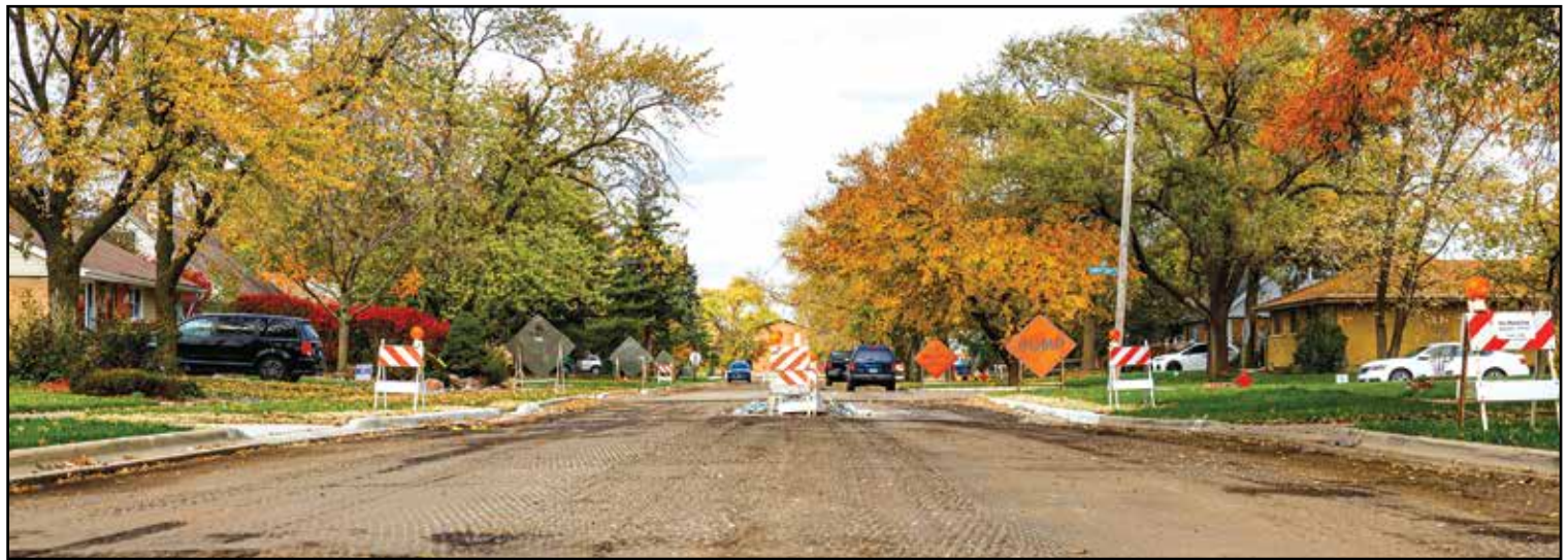
View of Olympic Drive facing North from Hartford Street ready to be repaved.

Three years are already completed, and the Bridgeview Street Resurfacing Project to improve our infrastructure and beautify our community continues. This year nearly half a mile of streets will be repaved, and in total, about 4.5 miles of streets, curbs, and sidewalks will have been completed since the project began in 2021. Storm sewers are also reviewed and repaired as necessary to maintain and improve the flood preparedness of the Village.