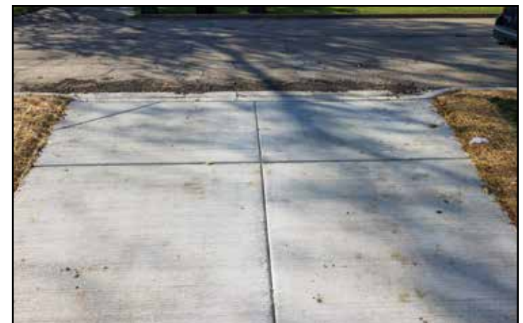
A newly redone driveway after it was removed during work for storm drain.