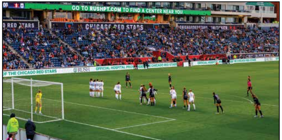
View of the field from the perspective of Bridgeview residents.

OL Reign's winger Megan Rapinoe also announced her retirement, making this night her final regular season game. Rapinoe's illustrious soccer career includ-