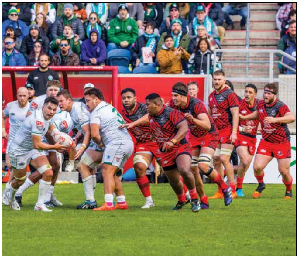
Chicago Hounds first match ever as an MLR Team was played against the Utah Warriors.