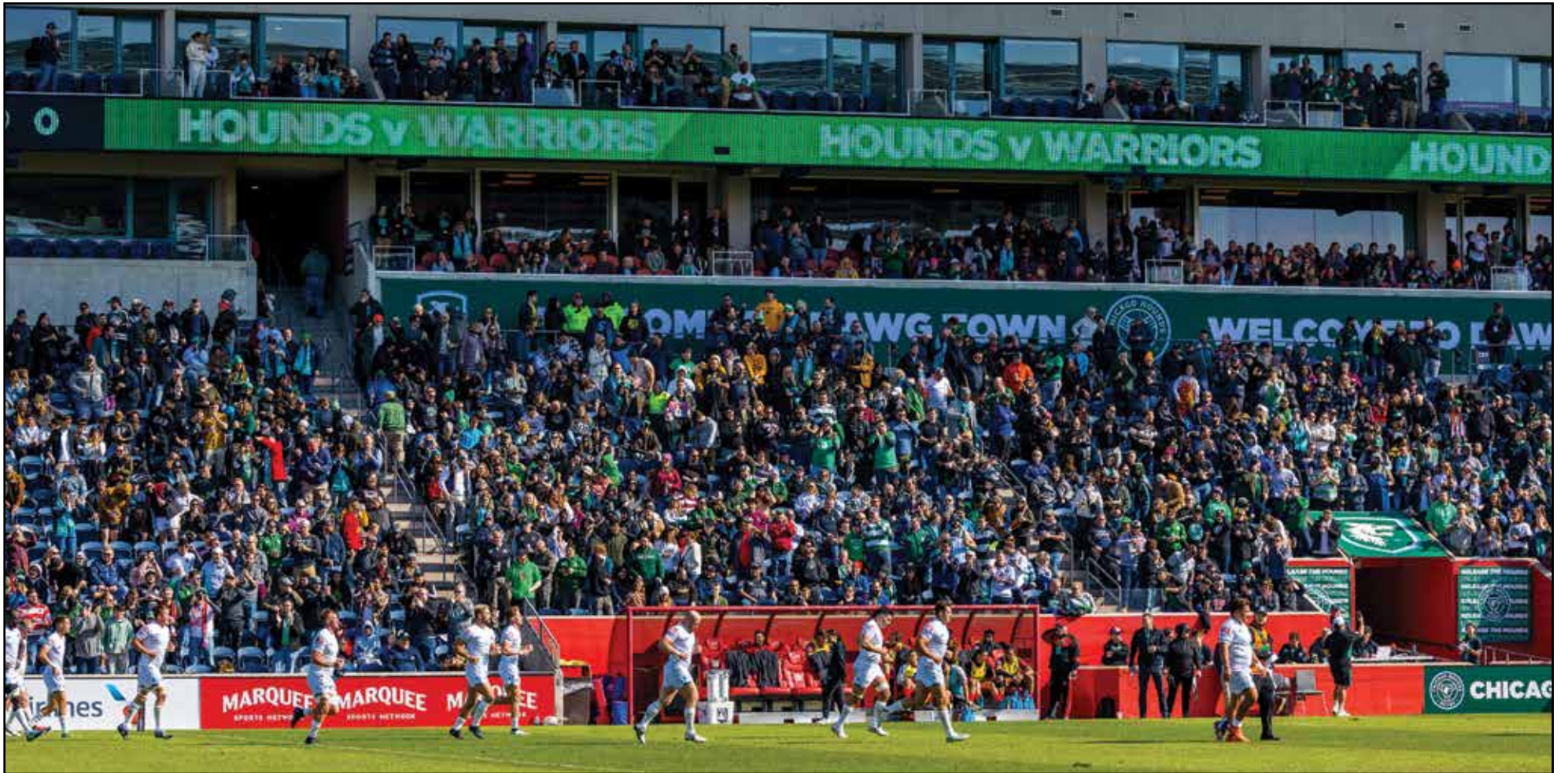
Rugby Fans fill the stands for the inaugural Chicago Hounds Major League Rugby match in March of 2023.