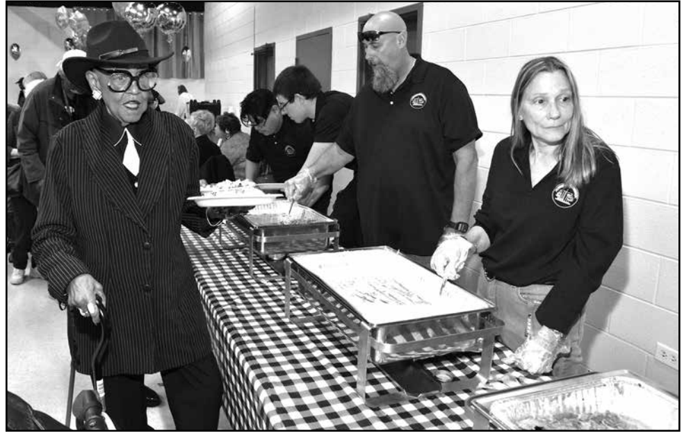
Bridgeview employees serving food to seniors.