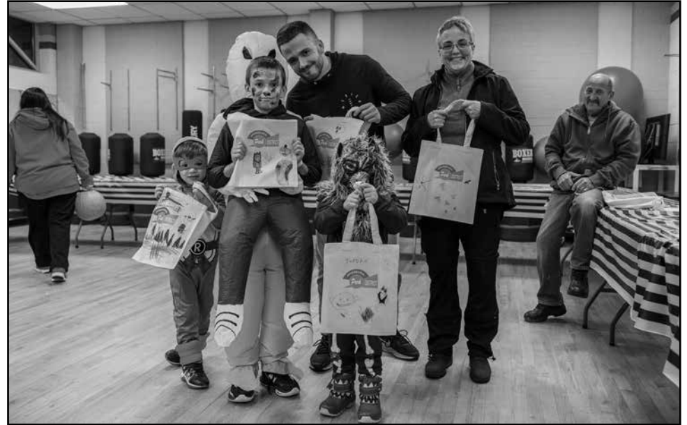
Bridgeview family shows off their decorated treat bags.