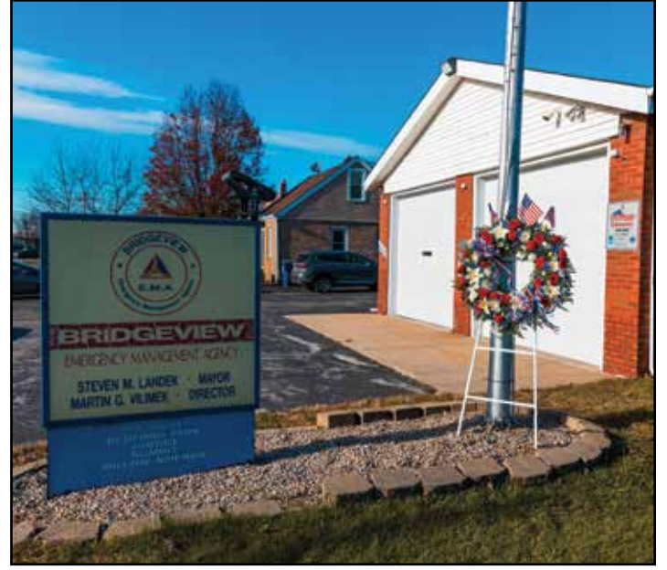
EMA Building at Garden Lane