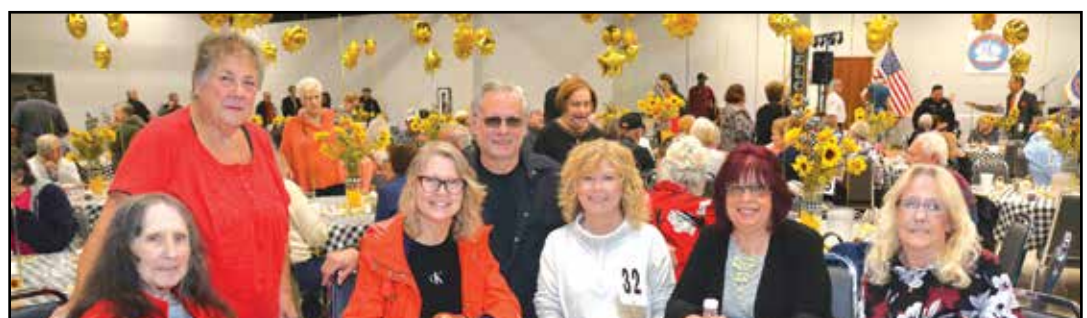
Smiling table of Mo-Town attendees.

Presort Std US Postage PAID Bridgeview IL Permit 318