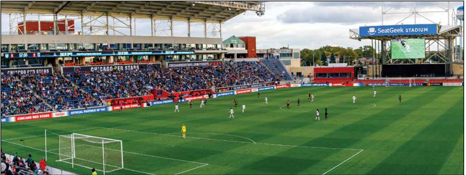
Chicago Red Stars 2023 Season Finale at SeatGeek Stadium.