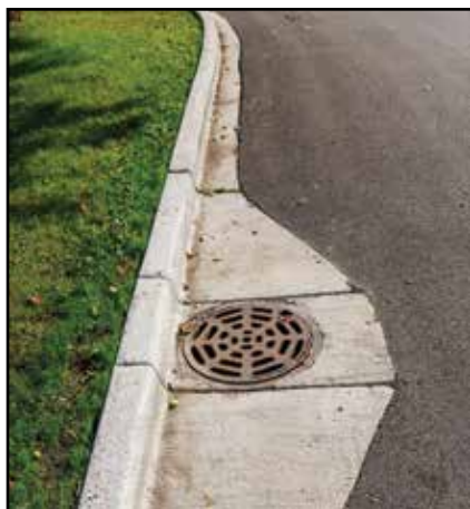
A newly replaced storm drain and freshly paved road.

The Bridgeview Street Resurfacing Project has been vital to enhancing the infrastructure of the Village, and Bridgeview is committed to ensuring that roads and sidewalks are safe and beautiful for many years to come.