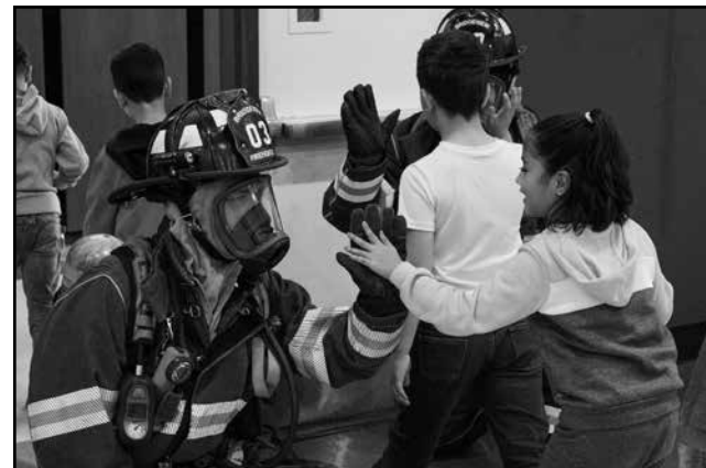
Firefighters show students their gear and high-five them as they exit.

Speaking to crowds of young students, Bridgeview fire fighting squads explained the importance of an emergency fire plan at home, why smoke detectors need their batteries replaced, and what actions people can take when a fire occurs in their home. Many students curiously asked questions about the work of firefighters and what to do in various scenarios. Firefighters happily answered questions and showed the children the tools and fire protection gear firefighters use when