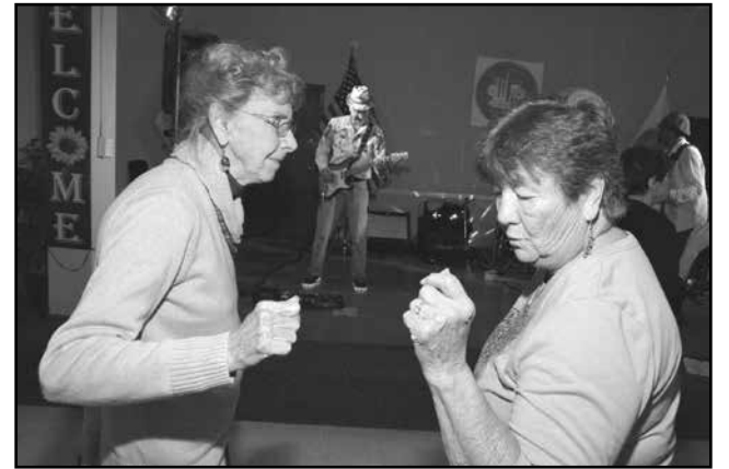
Two attendees dancing the afternoon away.

moved to the groove. A band member even walked around singing to tables of people and had them sing along too!