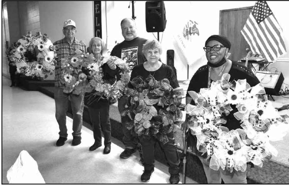
Winners of the wreath raffle stand with their new decorations.