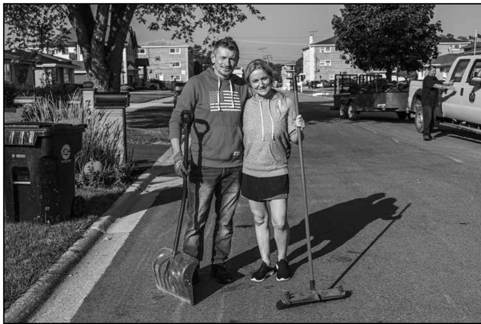
Bridgeview residents take their broom and shovel in hand to clean up Bridgeview!

The interactive musical experience and flavorful food created a joyful atmosphere that attendees happily contributed to with their singing, dancing, and clapping. The Village of Bridgeview thanks its employees, Charles & Company, and all who attended for making the luncheon a smashing success!