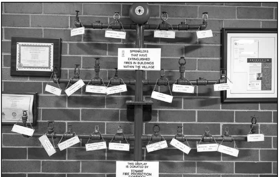
The life-saving sprinklers display in the foyer of Village Hall.

If you walk through the main hallway of Bridgeview's Village Hall, you'll come across a red display of 21 fire sprinklers each with the location and date of the fire they helped extinguish. These sprinklers have put out flames everywhere from a senior living facility to a strip mall to a factory. Ending blazes before they begin throughout Bridgeview's residential, commercial, and industrial properties is the job of fire prevention technology, and these sprinklers have proven their effectiveness by saving Bridgeview lives and money. They may not look like much, but sprinklers have been safeguarding our businesses and residents alike from fires from 1997 through the present. The next time you eat a donut or drive past a factory in Bridgeview, think of the sprinklers that made your daily activities significantly safer and a lot less hot.