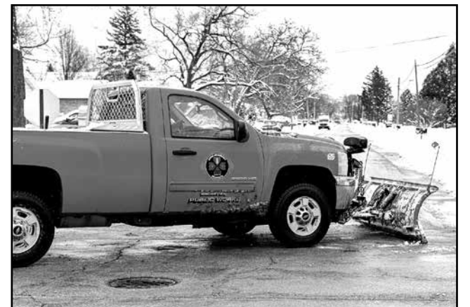
Bridgeview Public Works plows the streets after snowfall.

In order for the Village to efficiently clean the roads, please don't park on the village streets when the forecast for snow exceeds 1 inch of snow. That simple rule means NO Parking a car or truck on the street when snow is on the way. Don't fall asleep until you place all of your cars in your driveway. Cars on the street means the big