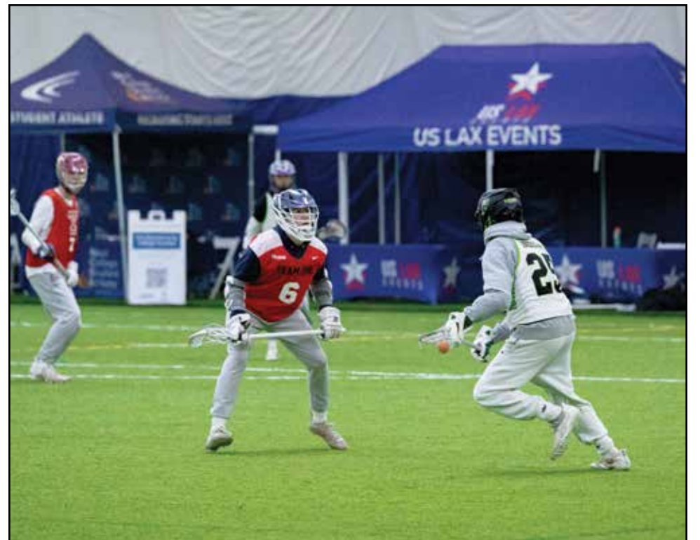
Competitor runs off with the ball after a face-off.