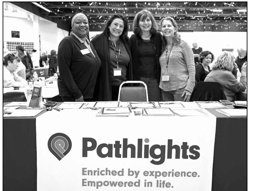
Pathlights Team gathers for a photo after a successful public service fair.

Local businesses, community organizations, and Illinois governments departments came together to provide this public services fair. Plenty of residents showed up over the course of the three-hour event to utilize the free services and learn about meeting their healthcare needs now and in the future. The Village of Bridgeview is committed to meeting the needs of its community, promoting public health, and serving its residents through events such as the public services fair. The Village appreciates the work of everyone who made the event possible and thanks residents for attending.