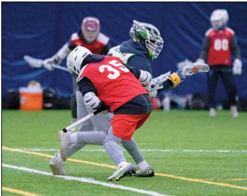
LAX Events returns to host tournament play in the Bridgeview Sports Dome.

SeatGeek Stadium, the Bridgeview Sports Fields, and the Bridgeview Sports Dome together have produced a regional and national location for a variety of competitive sporting events, highlighting a bright future for Bridgeview's investment in sports and entertainment as a sustainable source of revenue.