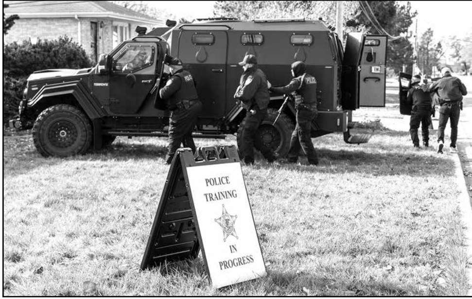
Bridgeview police officers exit a S.W.A.T. vehicle owned by the 5th S.W.A.T. district and approach the house.