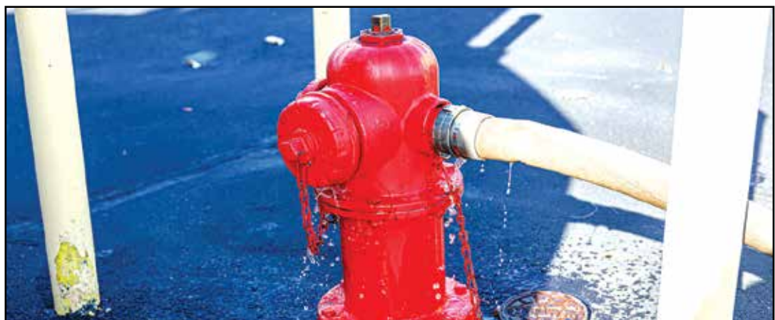
Water flows from Bridgeview fire hydrant.

mitment to fully serving residents by ensuring that keeping Bridgeview’s water system safe and reaffirming Bridgeview’s emergency preparedness are always top priorities.