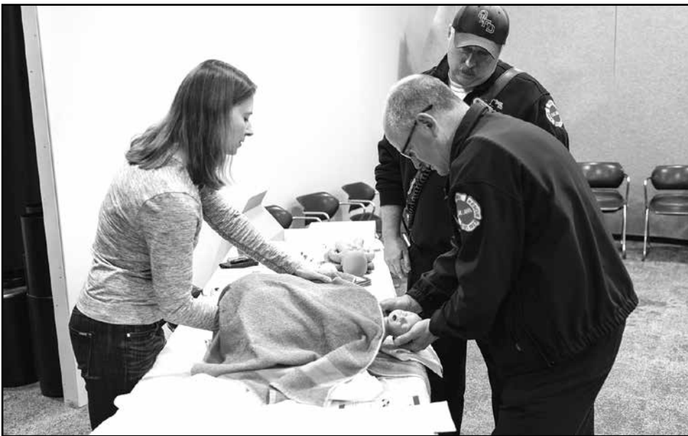
Paramedics practice delivering a baby with the guidance of an instructor.

the City of Chicago and currently works as an officer for the village of Robbins. She brings over a decade of experience and looks forward to serving Bridgeview to the best of her ability.