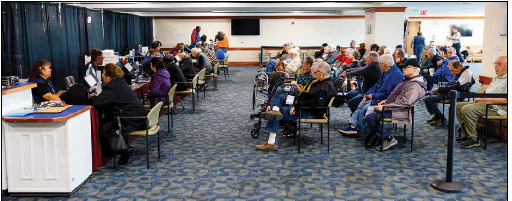
Illinois Secretary of State's Office employees hard at work serving seniors at SeatGeek Stadium.