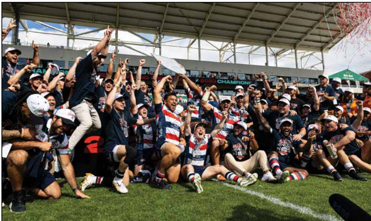
2023 Major League Rugby Champions the New England Free Jacks Celebrate their their incredibly tight victory.

Event: Chicago Red Stars Vs. OL Reign Date: Sunday, October 15th Kickoff: 4:00PM CST Location: SeatGeek Stadium Giveaway Rules Must be 18 or over to claim tickets Must be a Village of Bridgeview Resident Parking not included Tickets will be distributed via email Deadline to Register: Thursday, Oct. 12