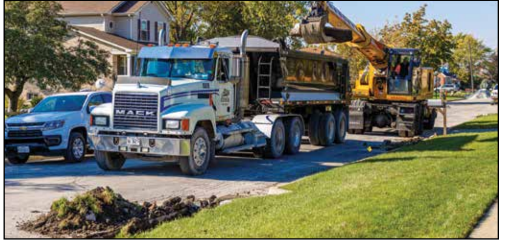
Excavator tears out portions of a residential curb in Bridgeview.

The Bridgeview Street Resurfacing Project is vital to enhancing the infrastructure of the Village and ensuring that roads and sidewalks are safe and beautiful for many years to come. The years of work put into the project has resulted in a total of nearly 4 miles of streets, curbs, and sidewalks completed. This investment will continue to keep our home values strong and our Village attractive.