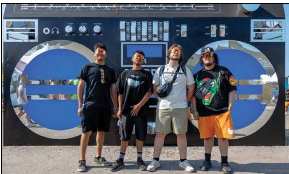
Playboi Carti closes out the 3 day Summer Smash Music Festival!

Loading up Bridgeview Stadium with innovative and imaginative events that fully utilize the surrounding property is key to its future success. We are grateful to be able to host some of the most unforgettable experiences for people from all over the country and sometimes the world, and we look forward to continuing to provide quality content in 2024.