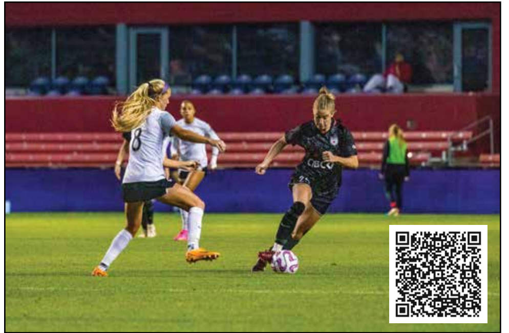
Back from the USA Women's National Team Alyssa Naeher is back on the pitch for the Red Stars. 2023 Season Red Stars have proven they have what it takes to win!

The Chicago Red Stars invite Village of Bridgeview residents to join them for the 2023 NWSL Season Finale Match against Seattle's OL Reign for FREE! To request tickets, village residents can scan the QR Code to signup online, call the Village of Bridgeview Customer Service office at 708.594.2525 (ext. 3), or send an email to info@villageof-bridgeview.com . Tickets will be assigned on a first come, first served basis and will be delivered digitally to your email prior to the event.