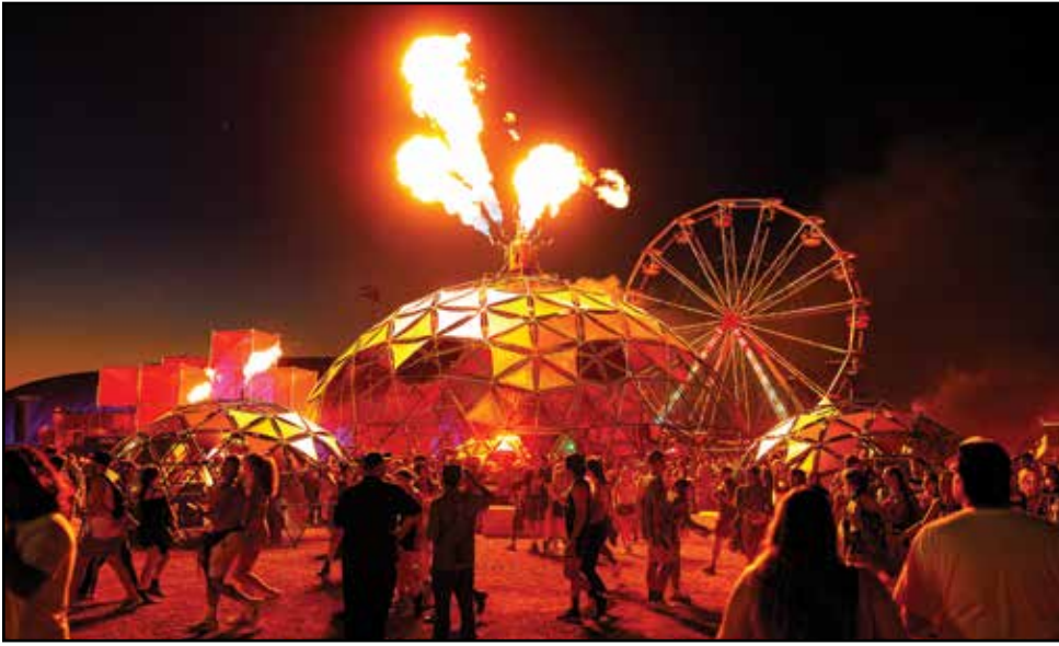
Ferris Wheel, the blazing Fire Pit stage, and Tetrominoes at the North Coast Music Festival.