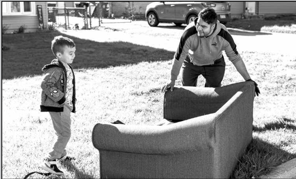
Family works together to get old furniture on the curb for cleanup day!

All non-bulk items must be bagged or boxed. For additional information please call the Bridgeview Customer Service Office at (708) 594-2525 Ext. 3. Happy Fall cleaning!