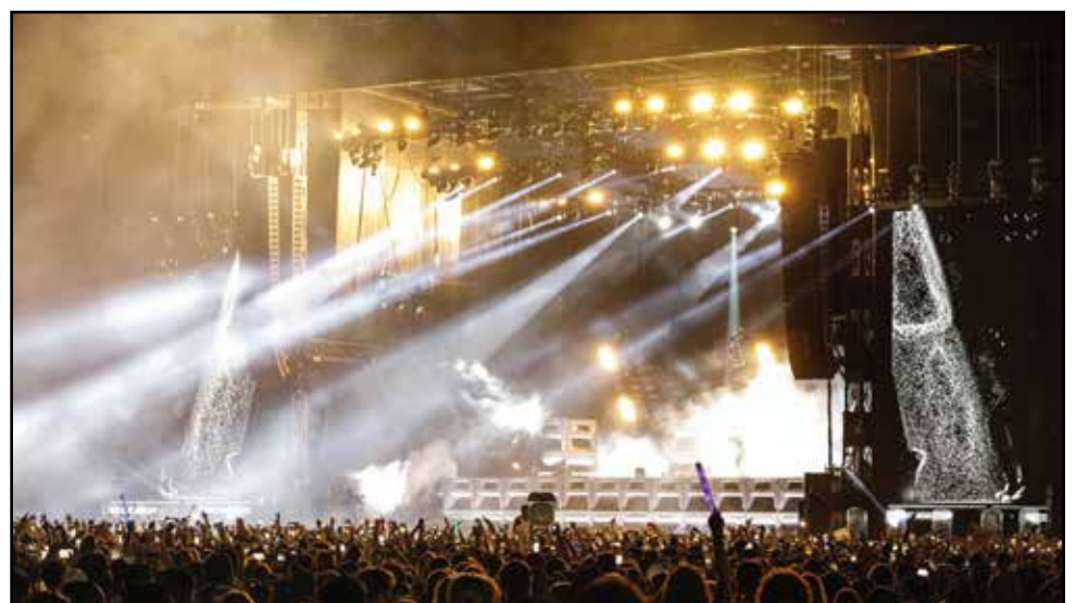
2023 Summer Smash's biggest names including Kid Kudi, Future, and Playboi Carti performed on the massive Lyrical Lemonade Starry Stage.