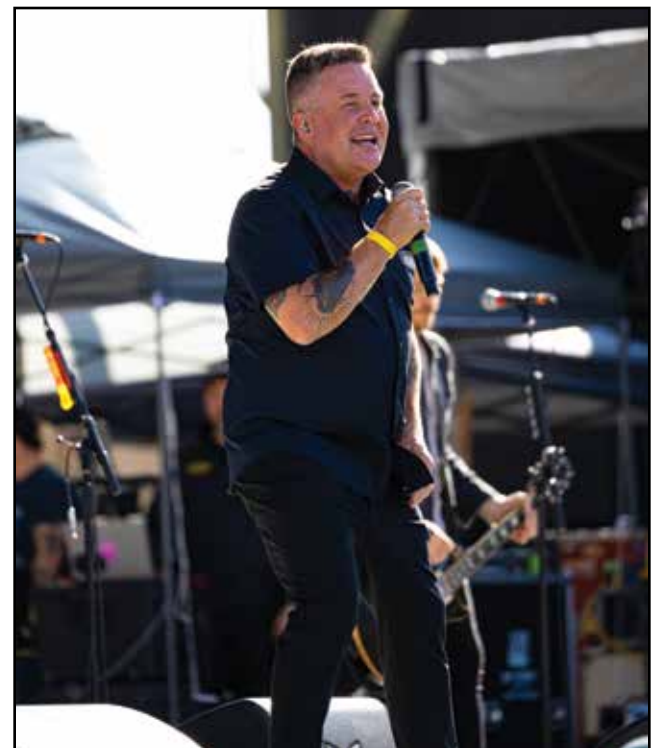
Dropkick Murphy's take the stage for the MLR Championship post-game concert.