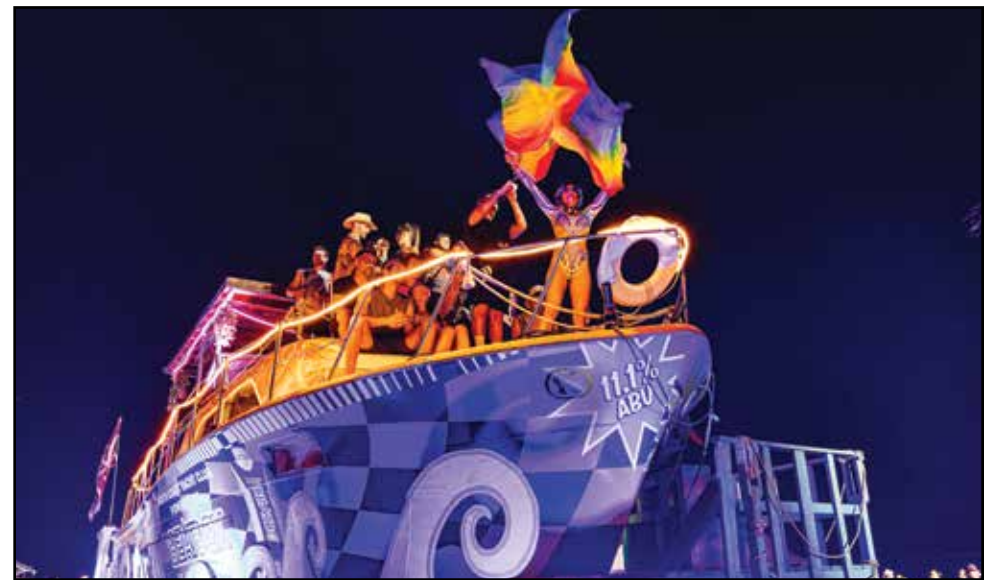
The NC Yacht by Beatbox at the North Coast Music Fest.