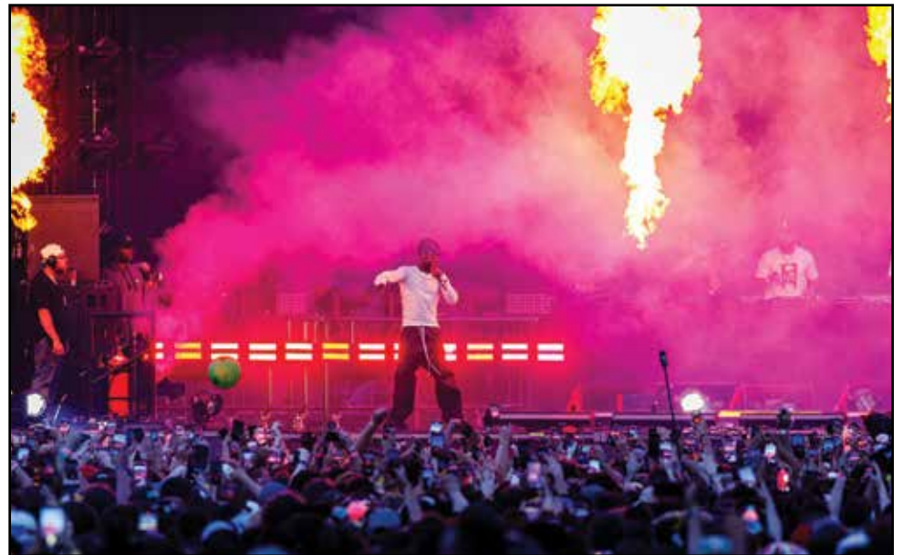
Lil Uzi Vert draws massive Summer Smash crowd!

existing fans coming back for more! The three-day North Coast Music Festival was jam-packed with action. The festival hosted some of the biggest names in EDM and house music genres, including Marshmello, Alesso, and Flume, who sent the massive North Coast crowds into a frenzy. The Stadium campus was filled with fantastical art installations, incredible musical talent, and high-quality vendors from around the country. Big-name corporate sponsors like Ford and Jose Cuervo seized the opportunity to be part of the festival and developed creative activations to engage with the Coasties, the friendly festival goers who came together for an amazing and unique experience celebrating their differences in an inclusive environment. North Coast truly provided everything a brilliant and memorable festival needs, and the results showed why SeatGeek Stadium was a great choice for this sensational event.