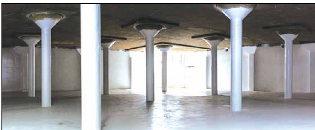
View of empty underground water tank after repairs and resurfacing.

ing and painting of the 2 million gallon above ground water tank was similarly completed earlier this year. Now, the focus turns to the water tower which will undergo maintenance and be repainted in 2024 after repairs are complete. The completion of this project will round out the updating of the Water Department's infrastructure, which will be safely contained behind a freshly painted black fence.