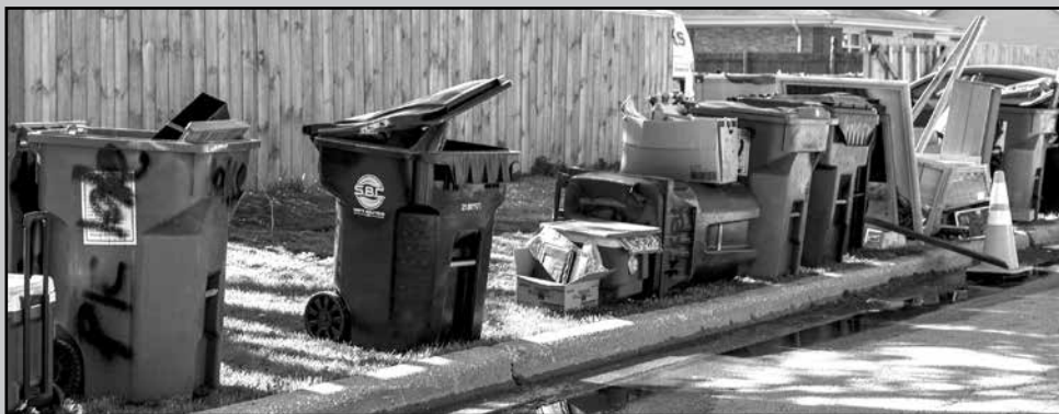
Don't be shy, fill up the curb and get rid of the clutter in your home!